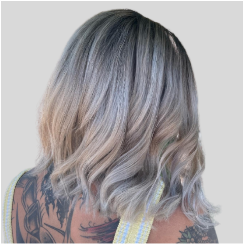
Level 1- $122

Want a softness to your dimension that gives a subtle lived-in look & allows for lower maintenance? This service will blend out your root area and tone your ends. Does not include blonding service.