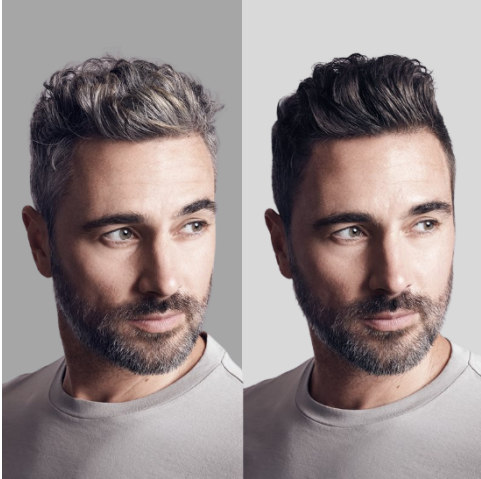
Level 1- $52

Natural looking men's grey blending. Requires no maintenance... get it done as often as you get your hair cut! People will notice you look different, but not that you colored your hair! Only takes 5-10 min to process.