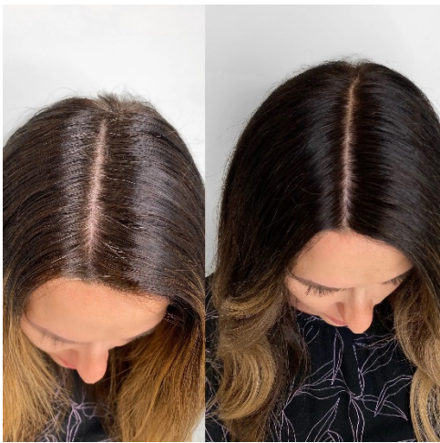
Level 1- $77

Color is applied at the scalp- on the new growth- during this maintenance service.