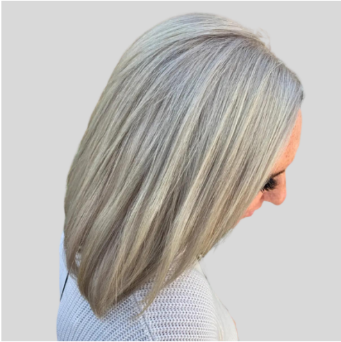
Level 1- $276

If it's been 6-12 weeks since you had your all-over blonde touched up, this is the one for you. If your regrowth is greater than 1 1/2 inches, a consultation is required.